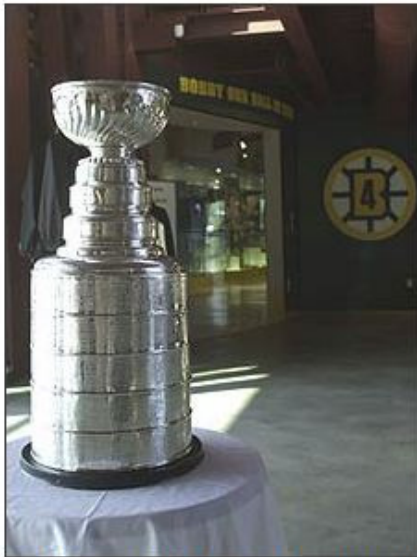
The Bobby Orr Hall of Fame is located in the Stockey Centre, right on the banks of gorgeous Georgian Bay. The Stanley Cup sits poised, ready to look around at the amazing artifacts that chronicle Bobby's life and career.

Dinner took place afterwards in the Stockey Centre, with the Stanley Cup there for fans to examine more closely. Many searched for the name 'Bobby Orr' engraved on the Cup. There it was, twice -- in 1970 and again in 1972. One man pored over the names on the 1973-74 and 1974-75 Philadelphia Flyers, as well as the 1988-89 Calgary Flames. It turned out to be the evening's master of ceremonies -- Parry Sound native, Terry Crisp -- who won the Cup twice as a player and once as a coach.