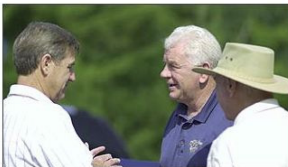
Two of Parry Sound's finest hockey exports joined up on the links for a few pleasantries and a whole lot of stories. Bobby Orr sets the ground rules on emceeding his event to Terry Crisp (right).