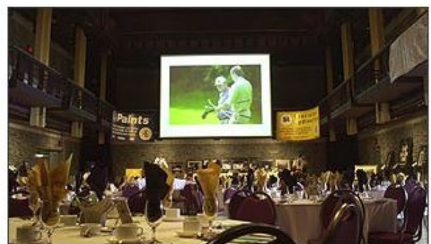
The incredible Charles W. Stockey Centre was the setting for dinner for the 5th Annual Bobby Orr Hall of Fame Celebrity Golf Classic.