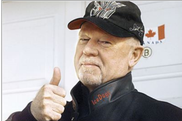
Cherry to renew coaching feud with Orr. Mississauga's Don Cherry will be back behind the bench for the CHL/NHL Top Prospects Game in Oshawa on Jan. 14 in Oshawa.