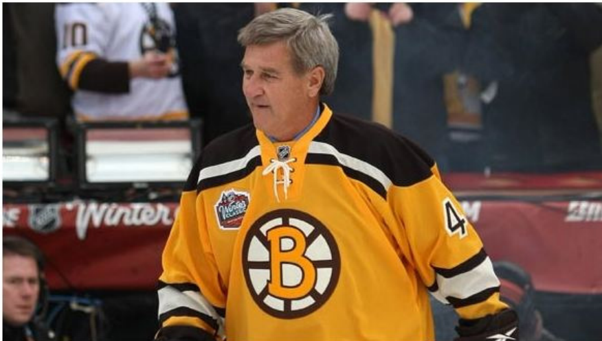
Bobby Orr #4, honorary captain of the Boston Bruins, walks onto the ice before the game against the Philadelphia Flyers during the 2010 Bridgestone Winter Classic at Fenway Park.