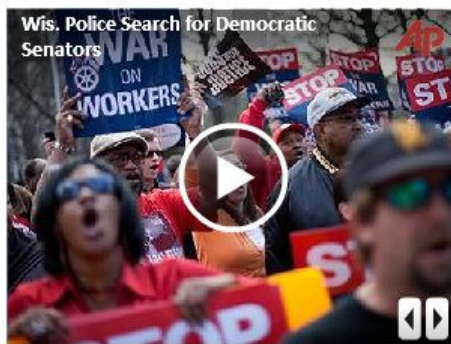
Wis. Police Search for Democratic Senators